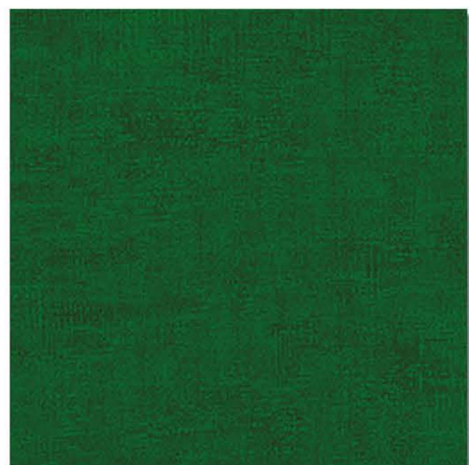
Melange 4509-807 44" Backing Fabric Option

* Indicates binding fabric. FQ = 18" x 22" (0.45m x 0.55m) All fabric quantities are based on 15yd bolts unless otherwise indicated.