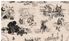
3581-30 Western Toile Tan