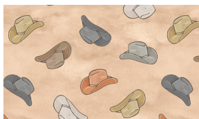
3586-32 Cowboy Hats Sand