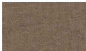
4509-302* Melange Dk. Gray