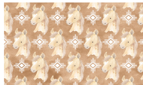
3583-32 Horse Heads Sand