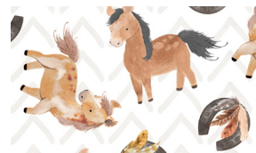
3587-01 Horses White