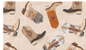
3585-30 Cowboy Boots Tan