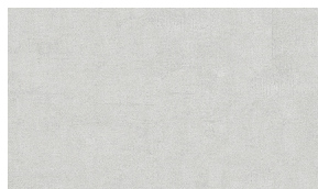
4509-105 Melange Ice