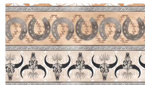
3589-30 Border Cowboy Stripe Tan