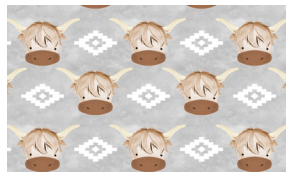
3584-90 Longhorns Grey