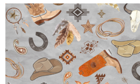
3588-90 Tossed Cowboy Motifs Grey