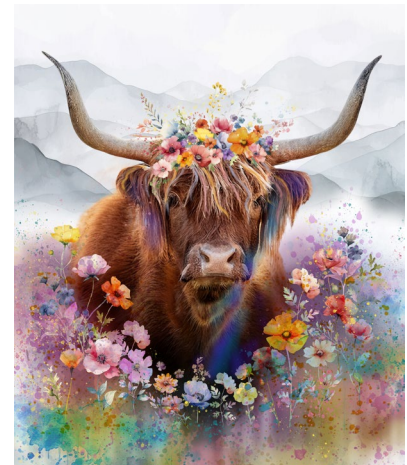
5052P-107 Highland Cow Panel Tertiary