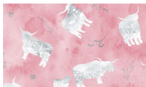
5047-22 Highland Silhouette Flamingo