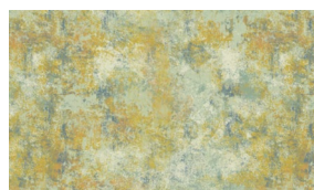
5051-61* Grassy Texture Sage