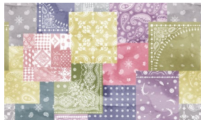
5043-107 Scrappy Bandana Tertiary

All fabric quantities are based on 15yd bolts unless otherwise indicated.