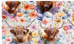
5044-107 Highland Flower Field Tertiary