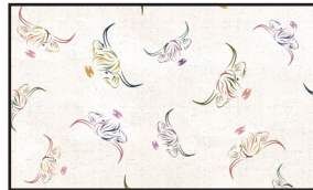
5045-41 Highland Linework Parchment