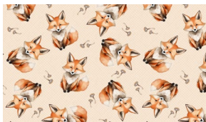
4924-44 Tossed Foxes Cream

All fabric quantities are based on 15yd bolts unless otherwise indicated.