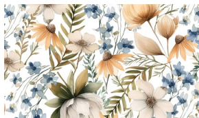
4927-01 Large Floral Ecru