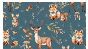
4933-77 Woodland Animals Navy