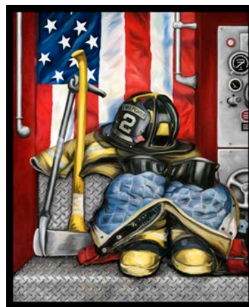
4104P-88 Firefighter Panel Red

**Creative Grids 45° Half-Square Triangle Ruler Required**