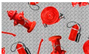
4100-90 Firefighter Equipment Gray