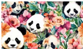
3976-66 Packed Pandas Sage