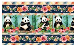
3978-66 Border Stripe Sage