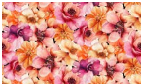
3972-22* Packed Floral Pink

All fabric quantities are based on 15yd bolts unless otherwise indicated.