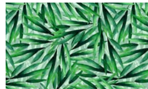
3975-66 Foliage Emerald