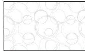
1953-01 Lower the Volume White