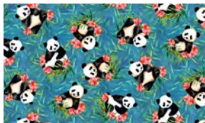
3973-77 Tossed Pandas Teal