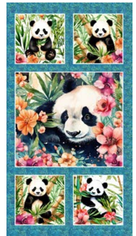
3979P-77 Panel Teal