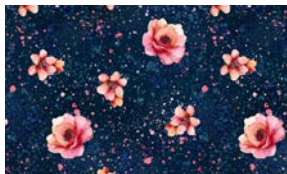
3974-88 Small Floral Navy