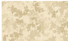
2311-41 Verona Parchment