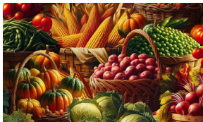
4873-66 Vegetable Baskets Green

All fabric quantities are based on 15yd bolts unless otherwise indicated.