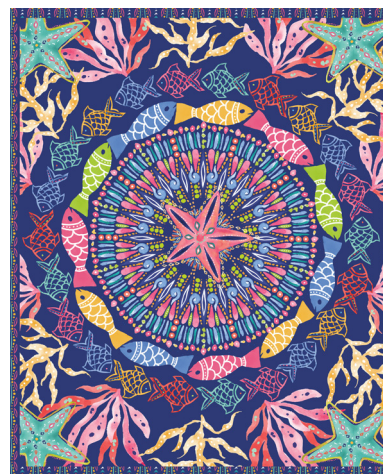
3738P-77 Mandala and Fish Panel Dk. Blue