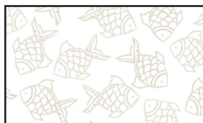
3729-01 Tossed Fish White