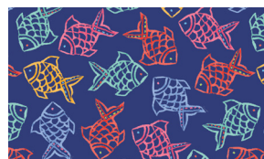
3729-77 Tossed Fish Dk. Blue