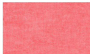
4509-402* Melange Med. Pink