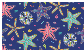
3732-77 Starfish Dk. Blue