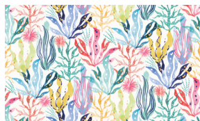
3733-01 Seaweed White