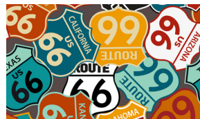
3756-67 Rt 66 Signs Turquoise