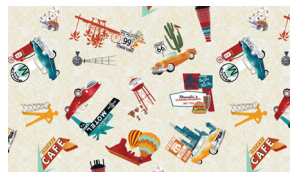
3757-41 Rt 66 Icons Ivory