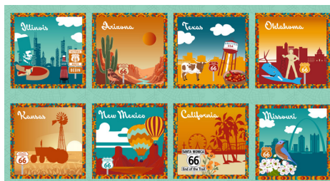
3753-67 Rt 66 State Blocks Turquoise