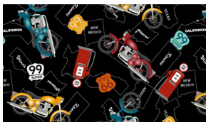
3754-99 Motorcycles Black