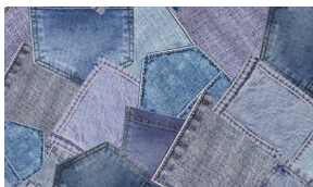
3723-75 Denim Pockets Med. Denim