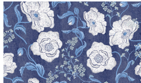
3718-75 Embroidered Floral on Denim Denim