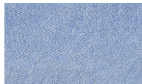
3724-70 Denim Texture Lt. Denim