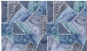
3717-75 Embellished Denim Pockets Denim