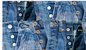
3720-75 Denim Flys Denim