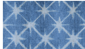
3722-75 Shibori Denim Pattern Lt. Denim