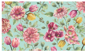
3796-67 Spring Flowers Turquoise