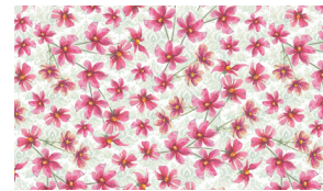
3798-22 Small Floral Pink