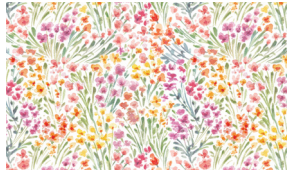
3791-01 Wildflowers White