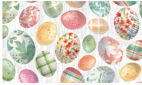
3790-01 Easter Eggs White