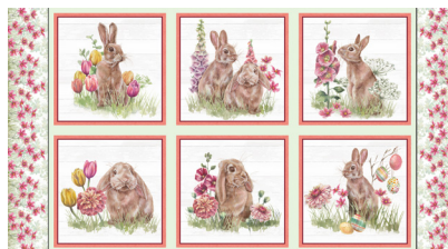
3788-60 Easter Bunny Blocks Lt. Green