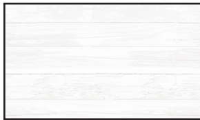
3794-01 Bleached Wood White