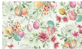
3797-60 Flowers & Easter Eggs Lt. Green