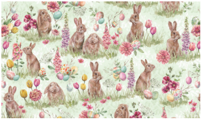
3789-60 Easter Bunnies Lt. Green