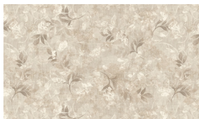
3712-41 Textured Leaf Ivory