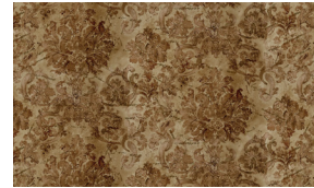
3708-39 Damask Cocoa