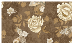
3713-39 Flower with Butterfly Cocoa