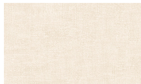
4509-100 Melange Cream