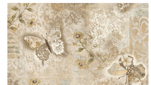
3715-32 Butterflies with Lace Latte