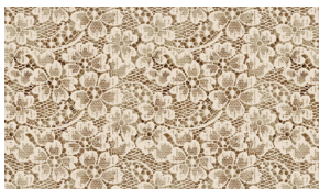
3711-41 Small Floral Lace Ivory