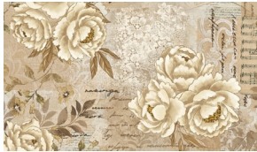
3705-32 Flowers with Lace Latte