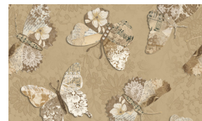
3714-32 Flower with Lace Latte