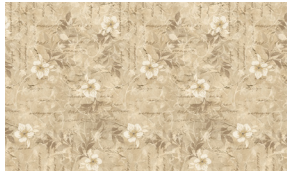
3706-41 Small Floral Ivory