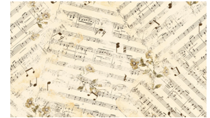
3710-41 Music sheets Ivory