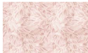
4575-22 Leaf Allover Dusty Rose