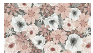
4571-22 Packed Flowers Dusty Rose