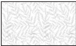
4567-01 Tiny Branches White

All fabric quantities are based on 15yd bolts unless otherwise indicated.