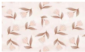
4568-20 Tossed Flowers Blush