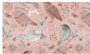
4569-22 Birds Dusty Rose