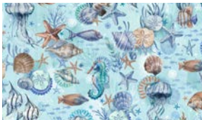
4560-70 Underwater Scene Lt. Blue