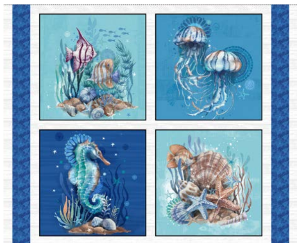
4564B-67 Pillow Panel Aqua