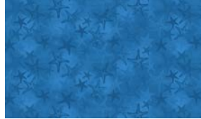
4556-77* Tonal Starfish Navy