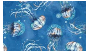
4561-72 Jelly Fish Med. Blue