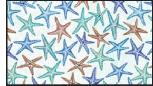
4557-67 Starfish Aqua