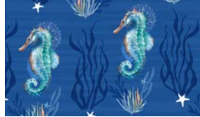
4555-77 Seahorses Navy