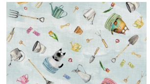
5225-17 Tools of the Trade Ice