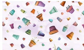
5220-15 Painted Pots Orchid