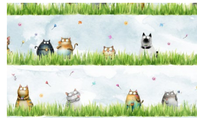
5223-17 Mini Lawn Stripe Ice