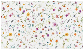
5218-17 Cutest Tiny Flowers Ice

All fabric quantities are based on 15yd bolts unless otherwise indicated.