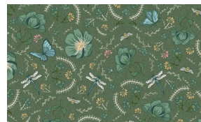
5144-77 Large Floral Navy