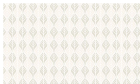
5149-44 Stripe Ecru