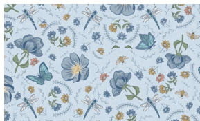
5144-11 Large Floral Blue