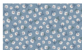
5148-11 Tossed Daisies Blue