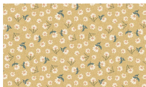
5148-33 Tossed Daisies Butter