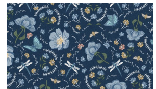
5145-77 Ditsy Floral Navy