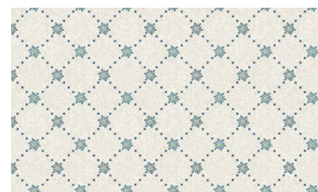
5150-44 Floral Tile Ecru