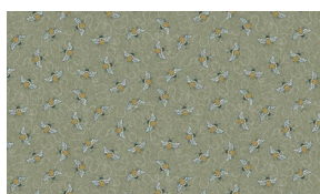
5147-66 Allover Bees Green