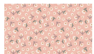
5148-22 Tossed Daisies Pink