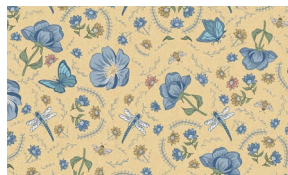
5144-33 Large Floral Butter