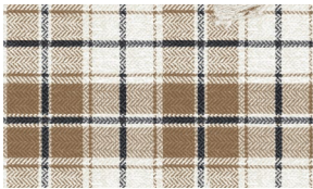
5167-36 Plaid Beige

All fabric quantities are based on 15yd bolts unless otherwise indicated.