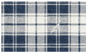
5167-74 Plaid Midnight