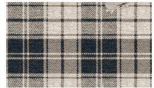
5167-96 Plaid Shadow