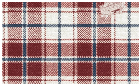
5167-86 Plaid Cranberry