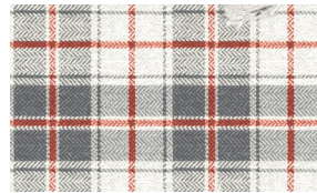
5167-93 Plaid Gray