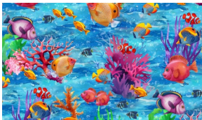
5293-77 Fish Pacific

All fabric quantities are based on 15yd bolts unless otherwise indicated.