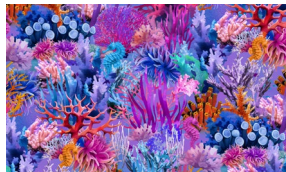
5296-52 Coral Reef Lilac