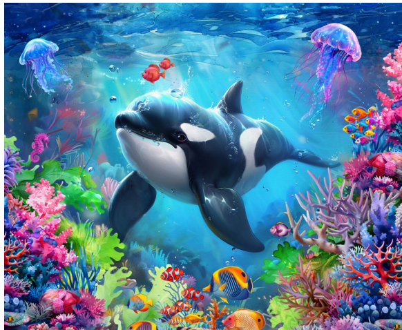
5300P-77 Orca Panel Pacific