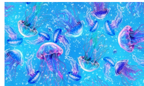
5298-77 Jellyfish Pacific