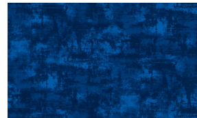
3188-77* Intermix Navy