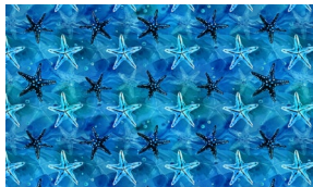
5294-75 Seastars Blue Ocean