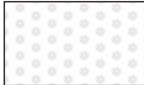
5258-01 Flower With Dots White