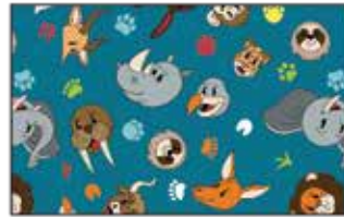
Tossed Animal Faces Teal – 2654-67