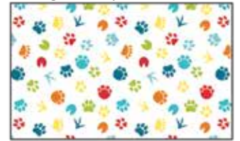
Tossed Footprints White – 2655-01