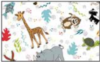
Tossed Animals White – 2652-01