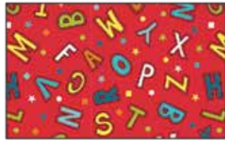
Tossed Letters Red – 2649-88