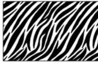
Zebra Black – 2650-99