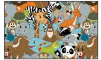
Stacked Animals Light Gray – 2651-90