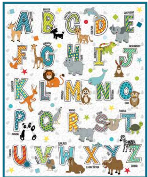
Panel White – 2659P-01