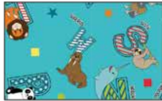
Tossed Animals and Letters Turquoise – 2653-75