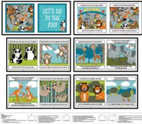
Book Panel Turquoise – 2658P-75