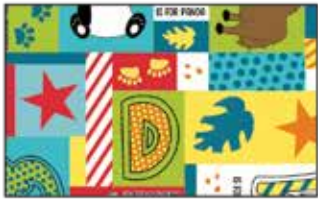
Patch Turquoise – 2648-75