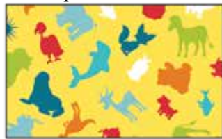
Tossed Animal Silhouettes Yellow – 2657-44