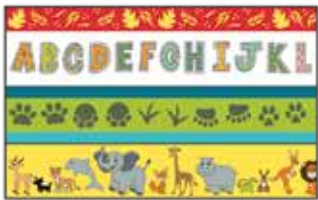
Stripe Yellow – 2656-44