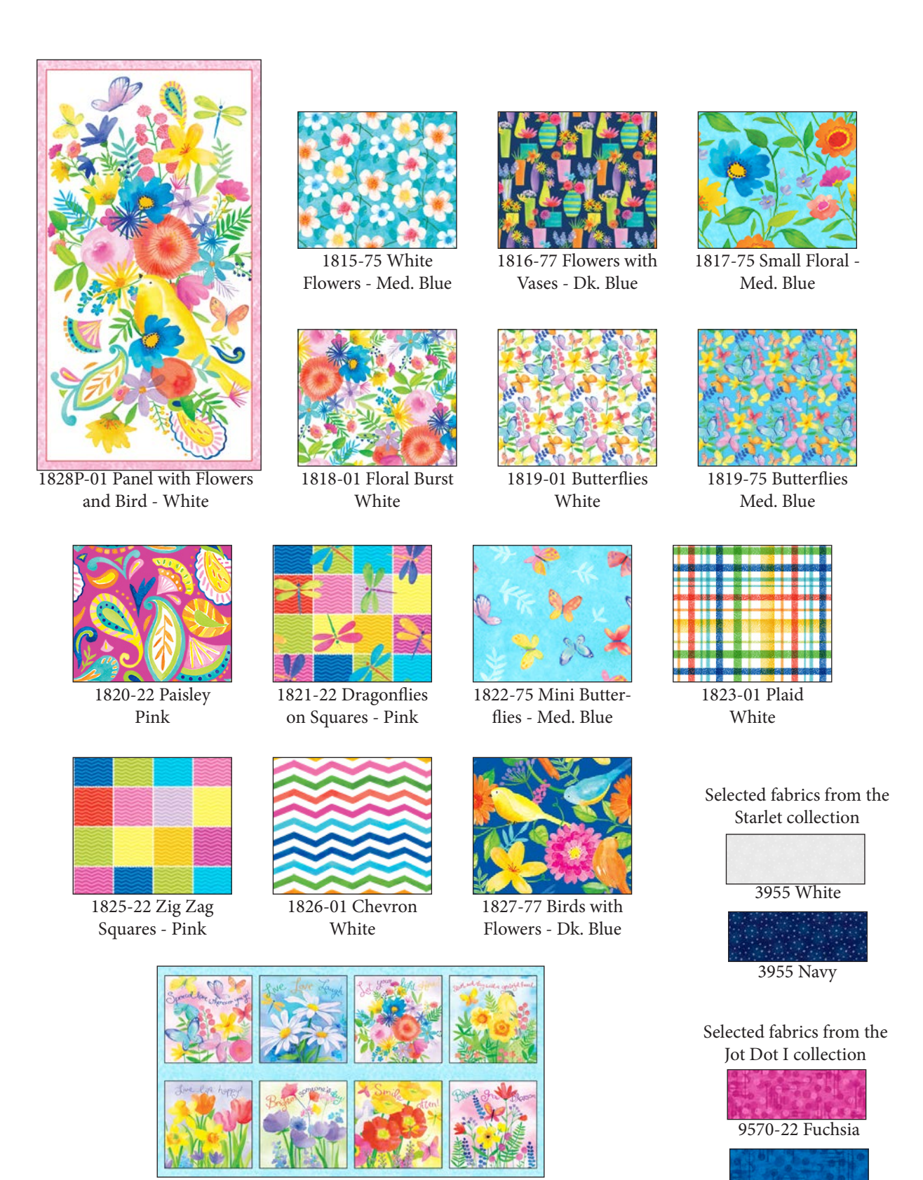
1824-75 Blocks Med. Blue