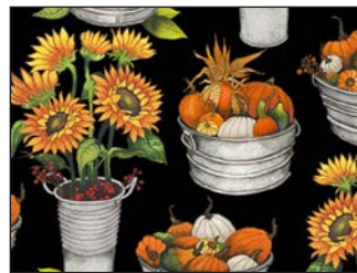
1526-99 Pumpkins in tubs & Sunflowers in vases - Black