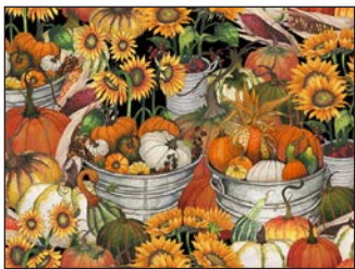
1524-33 Allover Pumpkins and Sunflowers - Orange