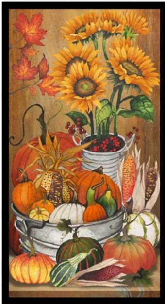
1532P-33 24" Harvest Panel Orange