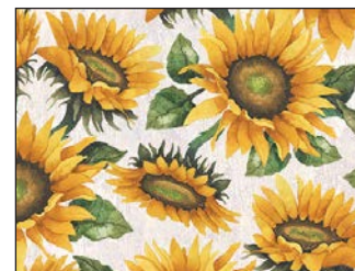
1530-44 Sunflowers Yellow

Selected fabric from the Urban Legend collection by Tana Mueller