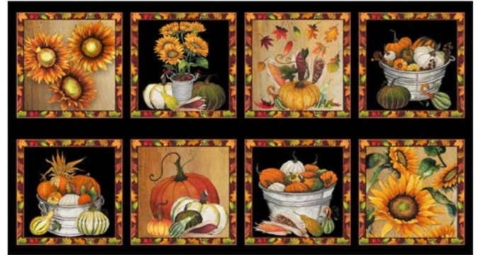
1523-99 Harvest Blocks Black