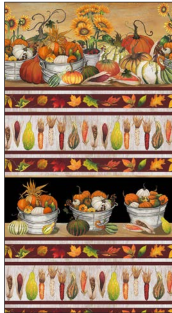
1531-33 Harvest Stripe Orange