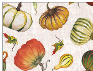
1529-41 Mini Tossed Pumpkins - Ecu