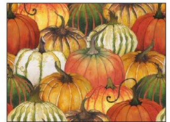
1527-33 Pumpkin Collage Orange