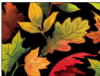
1528-99 Autumn Leaves Black