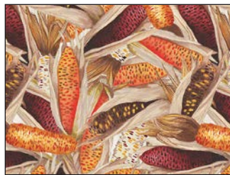
1525-41 Corn - Ecu