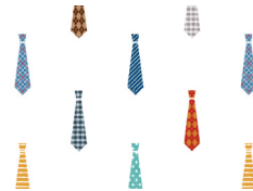
3205-01 Ties White