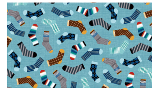
3206-17 Tossed Socks Aqua