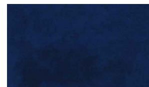
4516-607 Quilters Shadow Dark Navy