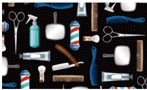
3203-99 Toiletry Kit Black

* Indicates binding fabric. FQ = 18" x 22" (0.45m x 0.55m) All fabric quantities are based on 15yd bolts unless otherwise indicated.