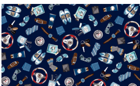
3208-77 Tossed Accessories Indigo