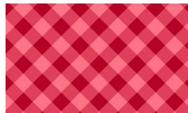
3399-88 Plaid Red