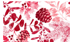
3397-88 Winter Foliage with Pine Cones Red