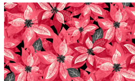
3396-88 Poinsettias Red