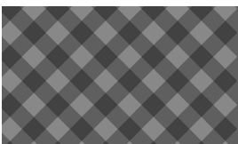
3399-95 Plaid Gray