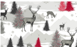
3389-90 Deer Scenic Lt. Gray