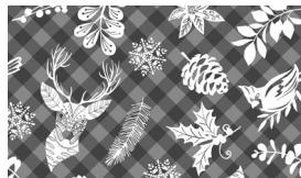
3393-95 Plaid with Winter Motifs Gray