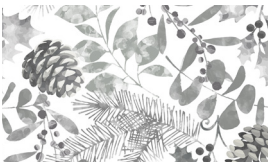
3397-90 Winter Foliage with Pine Cones Lt. Gray