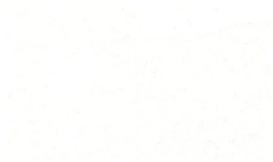
3955-WHITE Eclipse White