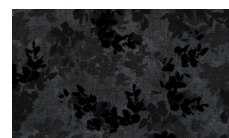
2311-99 Verona Black