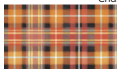
3310-33 Plaid Orange