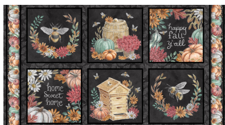
3305-99 Harvest Blocks Charcoal