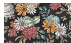
3308-99 Bees and Beehives Charcoal