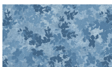
2311-72 Verona Sky Blue