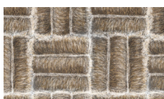
3304-39 Hay Bales