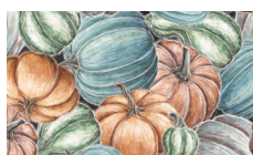
3306-33 Stacked Pumpkins Orange