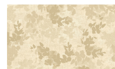
2311-41 Verona Parchment