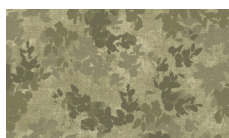
2311-60 Verona Taupe