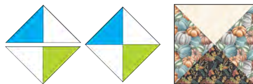
Figure 1 - Make (8) 10 3 / 4 " hourglass blocks.