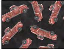
3302-99 Mini Red Pickup Trucks - Charcoal