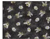
3311-99 Bees with Flowers - Charcoal