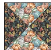
Figure 2 - Make (4) 10 3 / 4 " hourglass blocks.