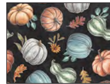
3312-99 Tossed Pumpkins - Charcoal