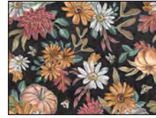
3307-99 Pumpkins with Flowers - Charcoal