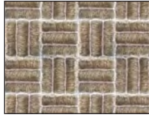
3304-39 Hay Bales Tan