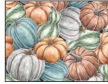
3306-33 Stacked Pumpkins - Orange