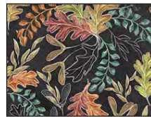
3309-99 Autumn Leaves - Charcoal