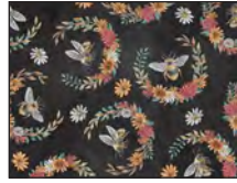
3303-99 Bees with Wreaths - Charcoal