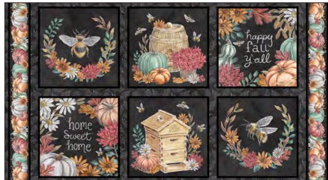
3305-99 Harvest Blocks - Charcoal

Selected fabrics from the Chameleon Collection