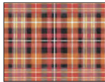
3310-33 Plaid Orange