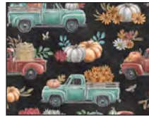
3313-99 Trucks with Pumpkins - Charcoal