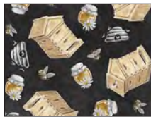
3308-99 Bees and Beehives - Charcoal