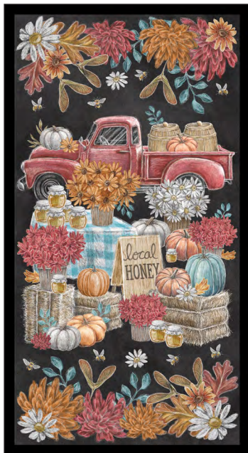
3314P-99 Harvest Panel 24" Charcoal