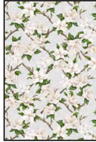
9845-90 Small Magnolia Lt. Gray