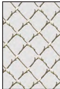
9848-90 Lattice Buds Lt. Gray