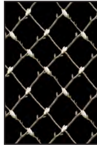
9848-99 Lattice Buds Black