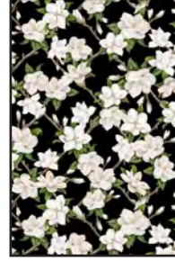
9845-99 Small Magnolia Black