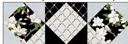
Figure 9 – Make 20.

9. Noting fabric orientation, sew one step 6 patch in between two step 7 patches ( figure 9 ). Press the seams away from center. Repeat to make twenty strips.