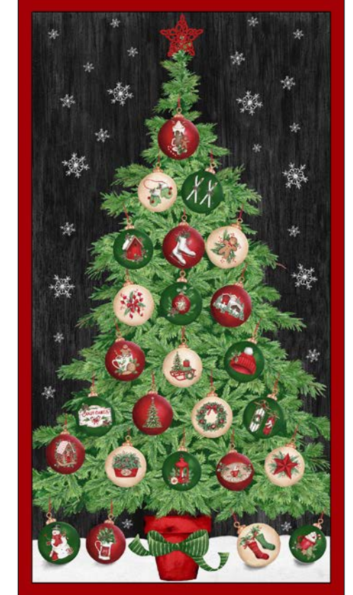
2293P-66 Christmas Tree Panel - Green