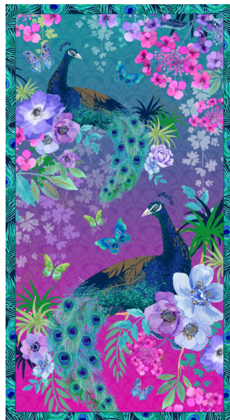
3448P-50 Peacock Panel - 24 Inches Plum