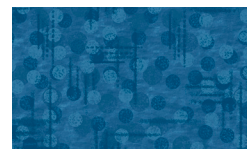
9570-75 Jot Dot Ocean

NOTE: This project requires more fabric than stated in the original pattern. Fabric E JotDot increased from 7/8 yd to 1 1/8 yds