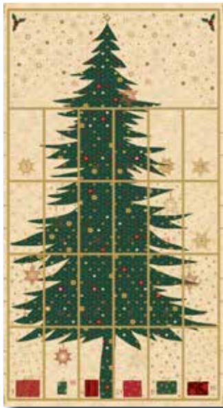
A: 4595-290 1 Panel