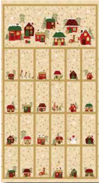
A: 4595-291 1 Panel