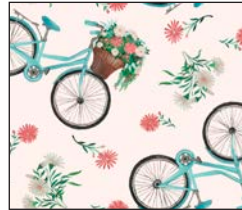
2342-20 Bicycles Lt. Pink