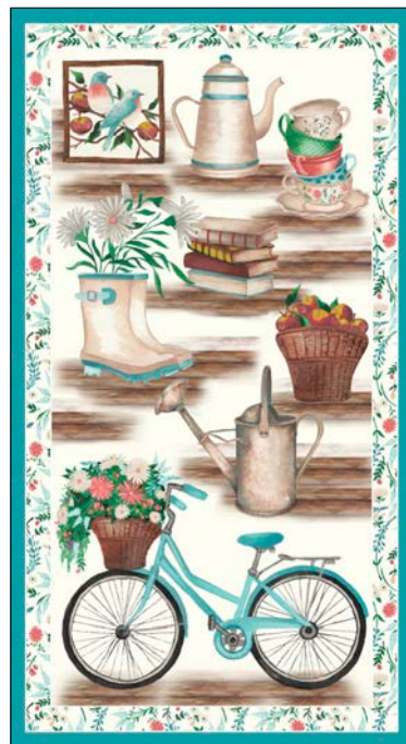
2349P-41 24" Panel Ivory

Selected fabrics from the Jot Dot Collection