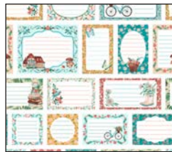
2347-41 Quilt Labels Ivory