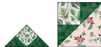
Figure 2 - Make (4) 5-1/2" blocks.

2. Sew a 9570-66 Jot Dot - Green triangle D to one side of a 3" 2341-41 Tossed Ferns - Ivory square. Press open. Sew another triangle D to the adjacent side of the same square. Press open and trim ears. Sew a 2348-20 Birds - Lt. Pink triangle B to the unit ( figure 2 ). Press the seam toward triangle B. Repeat to make four 5-1/2" corner blocks.