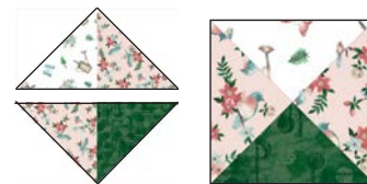
Figure 1 - Make (28) 5-1/2" blocks.

1. Sew a 2348-20 Birds - Lt. Pink triangle C to a 2343-41 Gardening Gear - Ivory triangle A. Press the seam toward the dark fabric. Sew a 2348-20 Birds - Lt. Pink triangle C to a 9570-66 Jot Dot - Green triangle E and press as before. Sew the two units together to make a 5-1/2" hourglass block ( figure 1 ). Press the seams open. Repeat to make twenty-eight 5-1/2" blocks.