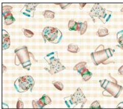
2344-41 Teapots & Teacups - Ivory