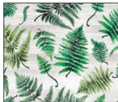
2341-41 Tossed Ferns Ivory