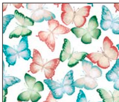
2339-41 Butterflies Ivory