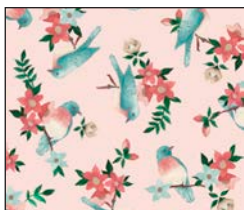
2348-20 Birds Lt. Pink