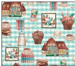
2345-75 Homes, Books, and Teapots - Lt. Blue