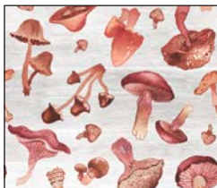
2340-35 Mushrooms Tan