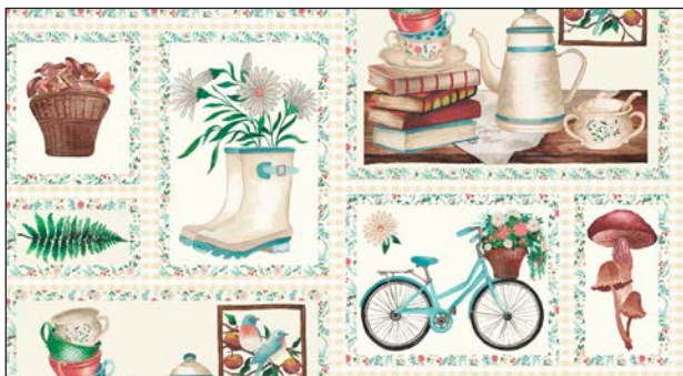
2346-41 Patch Design Ivory