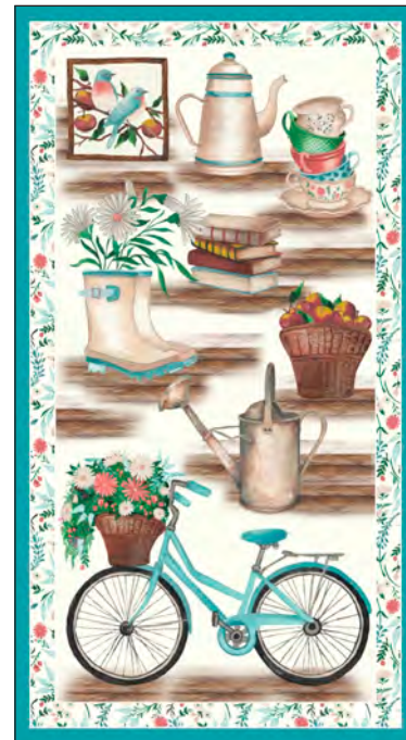
2349P-41 24" Panel Ivory

Selected fabrics from the Jot Dot Collection