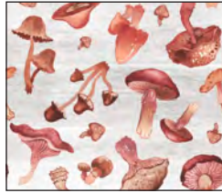
2340-35 Mushrooms Tan