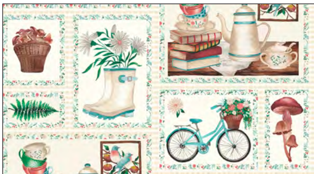
2346-41 Patch Design Ivory