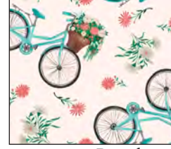
2342-20 Bicycles Lt. Pink