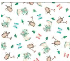
2343-41 Gardening Gear - Ivory