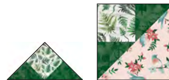
Figure 2 - Make (4) 5-1/2" blocks.

2. Sew a 9570-66 Jot Dot - Green triangle D to one side of a 3" 2341-41 Tossed Ferns - Ivory square. Press open. Sew another triangle D to the adjacent side of the same square. Press open and trim ears. Sew a 2348-20 Birds - Lt. Pink triangle B to the unit ( figure 2 ). Press the seam toward triangle B. Repeat to make four 5-1/2" corner blocks.