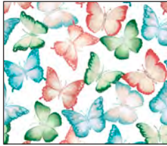
2339-41 Butterflies Ivory