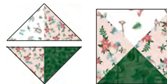
Figure 1 - Make (28) 5-1/2" blocks.

1. Sew a 2348-20 Birds - Lt. Pink triangle C to a 2343-41 Gardening Gear - Ivory triangle A. Press the seam toward the dark fabric. Sew a 2348-20 Birds - Lt. Pink triangle C to a 9570-66 Jot Dot - Green triangle E and press as before. Sew the two units together to make a 5-1/2" hourglass block ( figure 1 ). Press the seams open. Repeat to make twenty-eight 5-1/2" blocks.