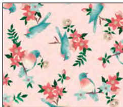
2348-20 Birds Lt. Pink