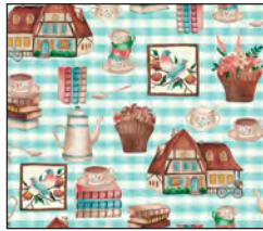
2345-75 Homes, Books, and Teapots - Lt. Blue