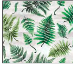
2341-41 Tossed Ferns Ivory