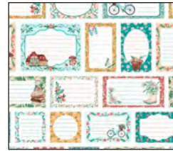
2347-41 Quilt Labels Ivory