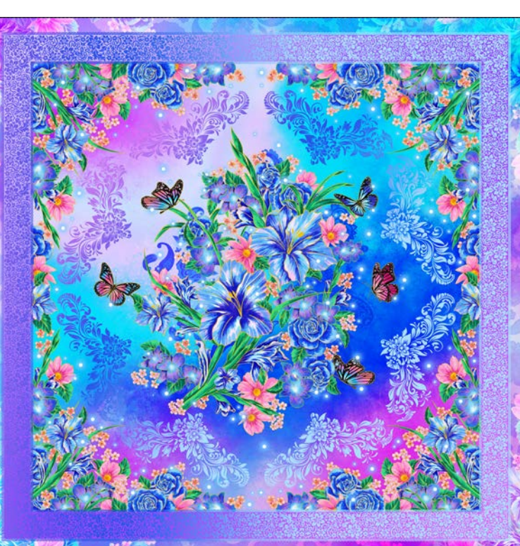
2247P-11 Floral Panel - Lt. Blue

Selected fabrics from the Starlet Collection