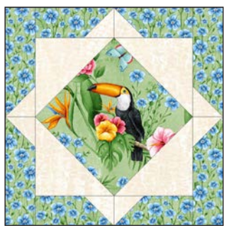
Figure 5 – Make (15) assorted 9-1/2" blocks.

5. Sew one Step 4 strip to the right and one to the left side of each Step 3 unit to make fifteen 9-1/2" blocks (figure 5). Press the seams away from the center.