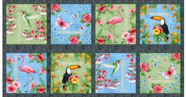
2365-95 Tropical Blocks Charcoal