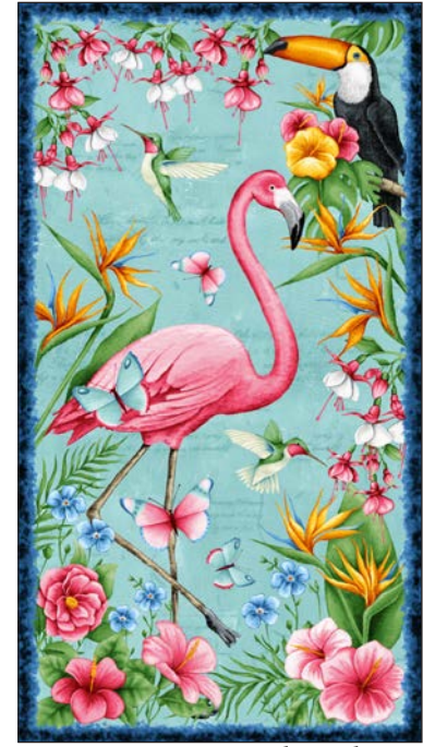
2375P-76 Tropical Panel Aqua

Selected fabrics from the Chameleon Collection