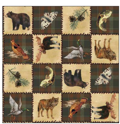
2054-39 Animal Patch Brown