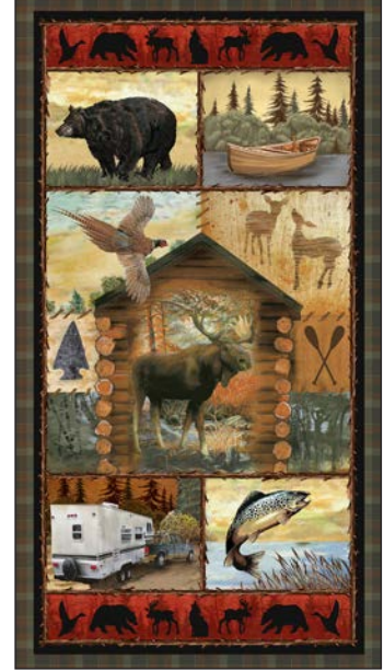
2062P-39 Wilderness Panel Brown