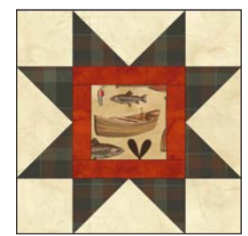
Figure 8 – Make (5) 9-1/2" blocks.

8. Sew one 2-3/4" 7101-41 Urban Legend – Ivory square to each side of the remaining Step 5 flying geese. Press the seams away from the center. Make a total of ten rows. Then, noting fabric orientation, sew one row to the top and one to the bottom of the Step 7 units to make five 9-1/2" star blocks (figure 8). Press the seams in one direction.