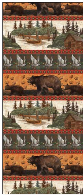
2056-39 Wilderness Stripe - Brown