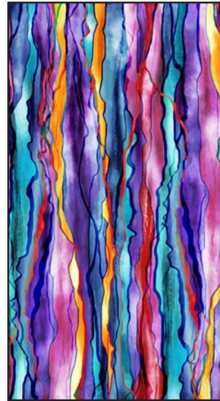
9726-70 Stripe - Blue