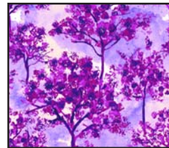
9729-55 Trees - Purple