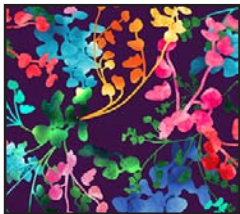
9727-77 Branches with Buds - Navy