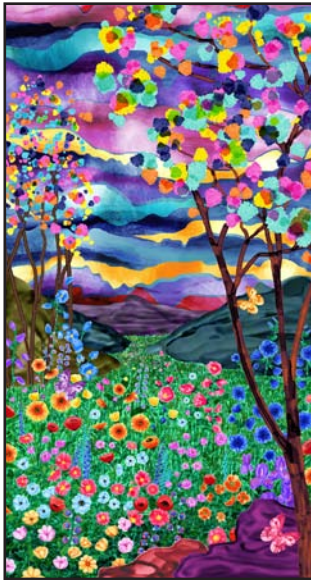
9724P-66 Panel Green