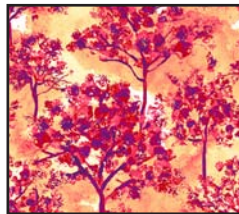
9729-33 Trees - Peach