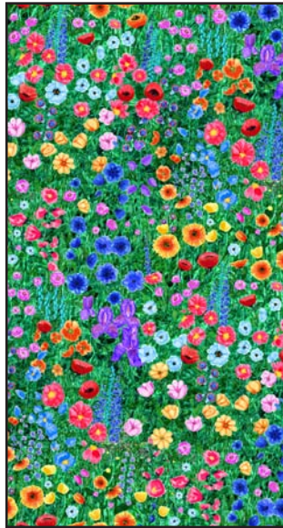
9725-66 Allover Floral Green