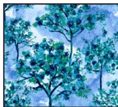
9729-70 Trees - Lt. Blue