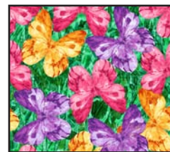
9730-66 Butterflies - Green