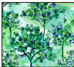
9729-60 Trees - Lt. Green