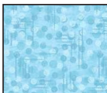
9570-11 Lt. Blue