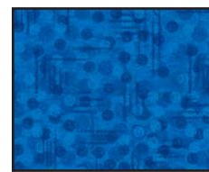
9570-77 Dk. Blue